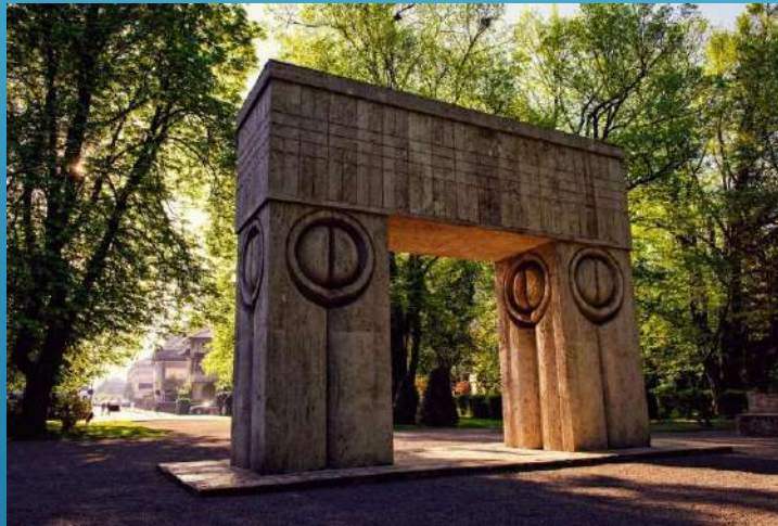
The Kissing Gate